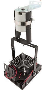
Vertical FlexMount to Mogul