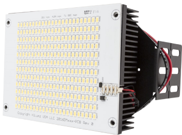
DM120 Front Angle

The unique design of the patent pending FlexMount™ System gives the High Efficacy Retrofit series the ability to easily retrofit a majority of fixtures whether it is a vertical or horizontal installation.