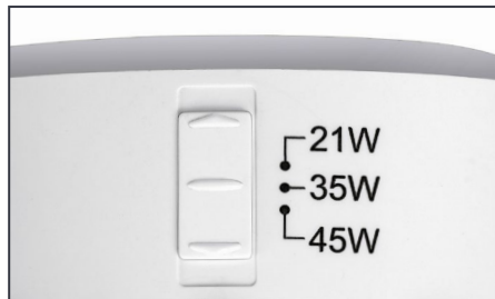
Select wattage (lumens) using built-in switch.