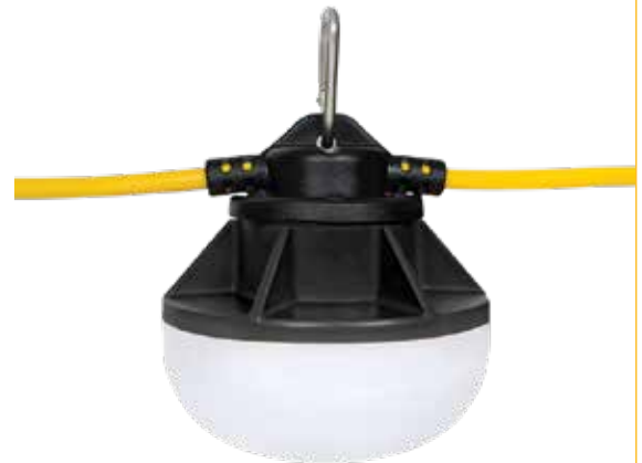
LED CordLights (High Lumen Output) Part Number: 16050