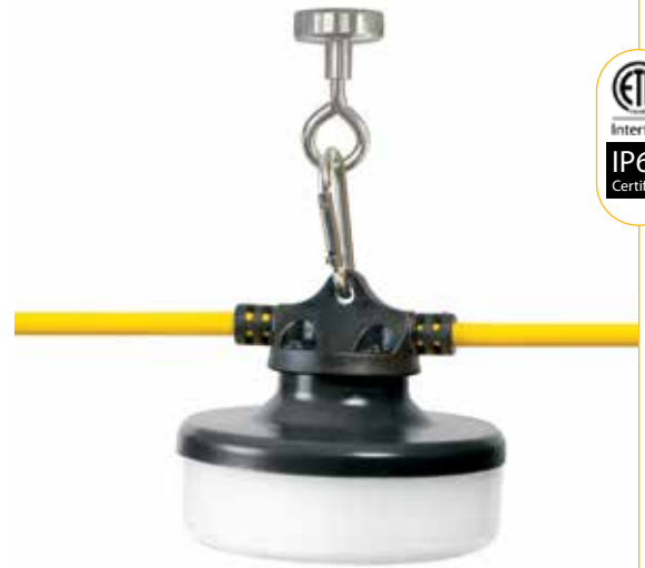
LED CordLights (Standard Lumen Output) Shown with Magnetic Suspension Hanger Part Numbers: 16140 and 16145; Magnetic Suspension Hanger: CORDLIGHT-MH