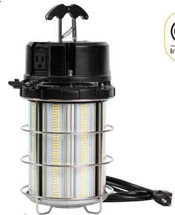
150-Watt Part Number: 15723