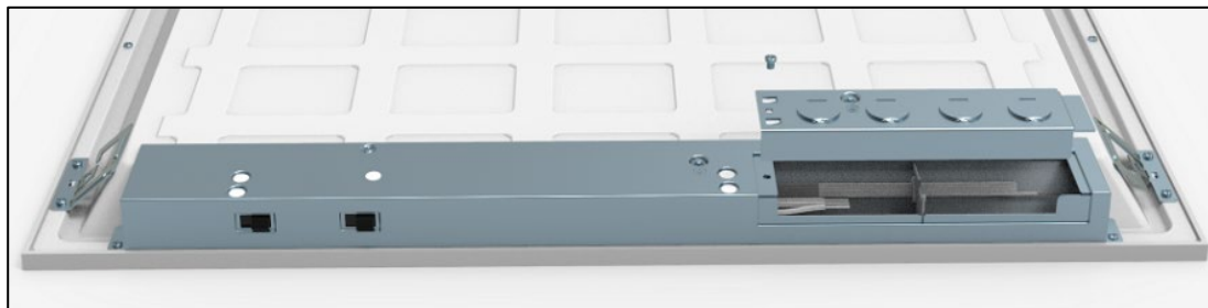
SWITCH LOCATION DETAIL FOR CCT & WATTAGE