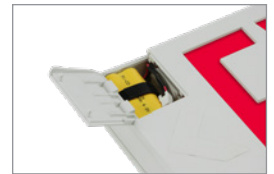
Tool-less hinged door for easy and safe access to isolated low voltage battery compartment. Only available with G2-NI option.