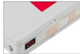
Numeric Indicator for dependable visual status and fault detection. Only available with G2-NI option.

Illumination: Long-life, high-intensity, red or green LEDs Housing: Rugged, injection-molded UL 94 5VA flame-retardant, high-temperature thermoplastic housing Input: 120/277VAC dual primary, 60Hz Battery: Maintenance-free NiCad battery Run Time: UL Listed 90 minute emergency run time, 24 hour recharge time Legend: Fully-illuminated 6" characters with 3/4" stroke and field-selectable directional chevrons Mounting: Ceiling, end or wall mounted, canopy included Finishes: Black or White Options: 2CI = 2 Circuit Input 220 = 220VAC, 50Hz Input G2 = Self-test/Self-diagnostics G2-NI = Self-test/Self-diagnostics with Numeric Indicator and Battery Access Door USA = Meets Buy America Requirements Certifications: UL Listed for Damp Locations and meets or exceeds the following: NEC requirements and NFPA 101. California Energy Commission (CEC) compliant Warranty: Any component that fails due to a manufacturing defect is guaranteed for five years with a separate five year prorated warranty on the battery. The warranty does not cover physical damage, abuse or instances of uncontrollable natural forces. See the full Exitronix warranty document for detailed information. (Terms and Conditions apply)