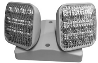
Double lamp with No Options