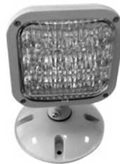
Single lamp with Weatherproof (WP) Option