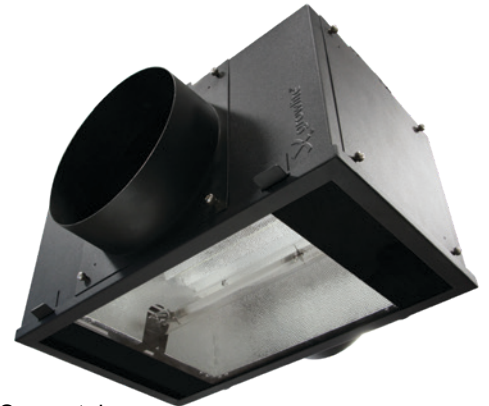
Lamp Sold Separately

The only double-ended horticultural reflector with Concealed Vacuum Airflow Technology®, the HDE combines proven lamp performance with the ability to transfer heat easily from the grow environment. The HDE has flexibility and versatility built into the design with 4-way 8" ducting and included adapters. Growers can customize the HDE as needed for specific grow room applications. A-hinged lens and innovative reflector installation make cleaning and maintenance of the HDE extremely easy.